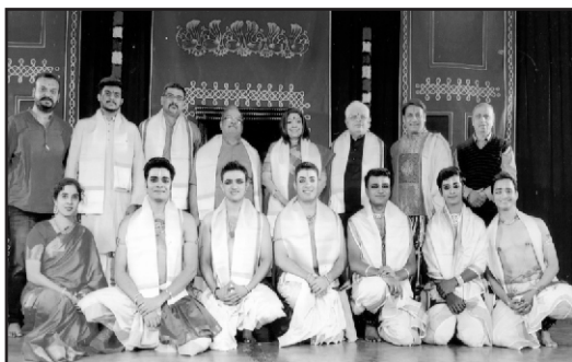
Artistes with Guests