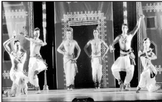
Six Artistes Performing at the final Episode